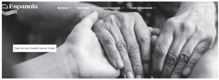
Photo - An Age Friendly survey is underway in Espanola. Go to espanola. ca for more information or to take part. Paper copies are also available at the town office, rec centre and library.

The Town of Espanola is asking for the public's input on a new action plan focusing on age friendly strategies.