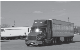
Photo - Manitoulin Transport has won another prestigious award, this time with a focus on road safety.