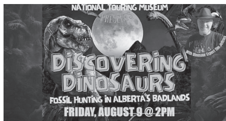
Photo - It's free, it's fun, and it's in Espanola... Dinosaur Tour at the Espanola Public Library.