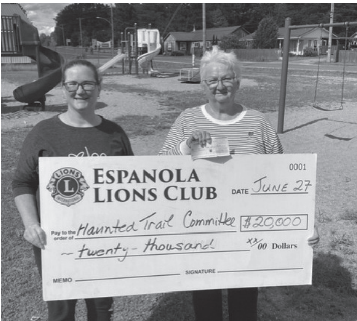
BOO...BOO...Ah yes, the sound frequently heard in Massey at Hallowe'en as you walk the HAUNTED TRAIL!!! This annual event has thrilled and of course scared young and old over the years. And all to raise

funds to provide playground equipment for kids in town. All those countless volunteer hours have now paid off. Soon to be seen at the existing playground at the Memorial Park at the Fairgrounds will be a Miracle Gravity Rail. This is a swing which is a cross between