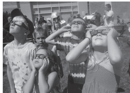
Photos - Dortwood Observatory in Webbwood will host solar eclipse safety seminars and show how to safely watch a solar eclipse. It is expected to occur April 8th.

By Rosalind Russell - April 8th is a day off from school for children due to the solar eclipse and a local area observatory is preparing the public for the event.