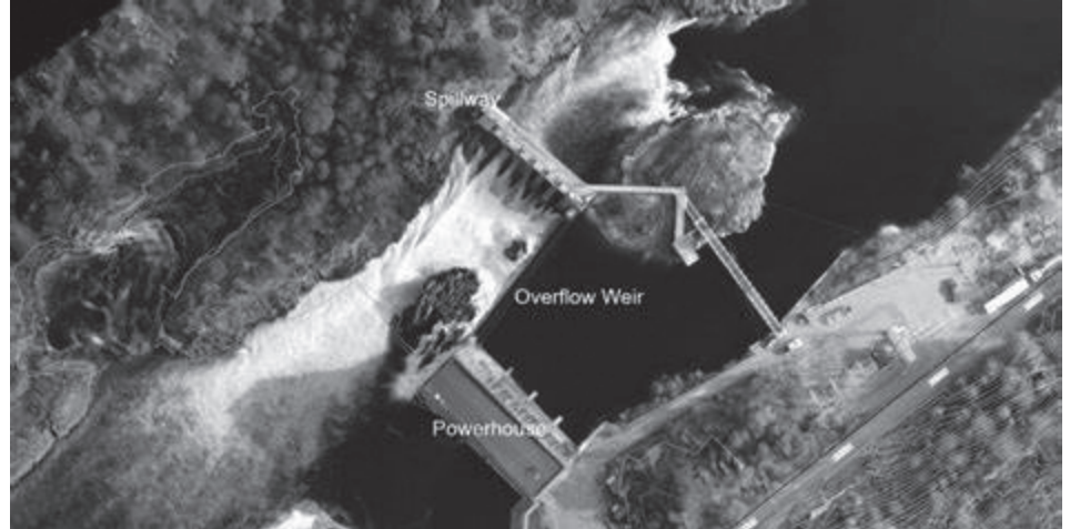
Photo - New safety booms or replacements are being considered for five dams on the Spanish and Vermillion Rivers.